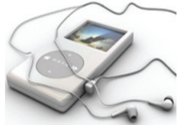
iPod/MP3 $200 = $18/month/1 year