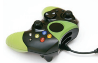
Xbox 360 $425 = $37/month/1 year