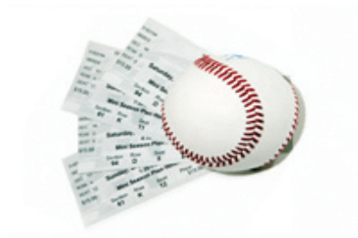
Sports Event Season Tickets $75/month/season