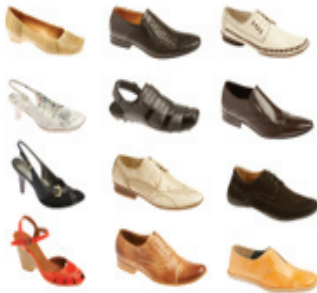
Designer Shoes $175/month