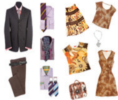
Designer Clothes $250/month