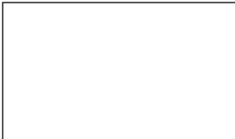
Your own choice Cost: $